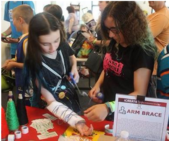
Local students learning to create an arm brace.

For the third year in a row, SBU iCREATE (previously known as the SBU Innovation Lab) attended the Eastern Long Island Mini Maker Faire , which took place this year on June 10 at the Port Jefferson Maritime Explorium. The Maker Faire is a family-friendly showcase of the interesting things people - from engineers to artists - do in the spirit of innovation, creativity, resourcefulness and invention. SBU iCREATE was featured as one of the makers and showcased several different interactive activities including 3D Doodler pens, a PacMan robot maze, DIY arm braces, and 3D puzzles made of cardboard and balsa wood.