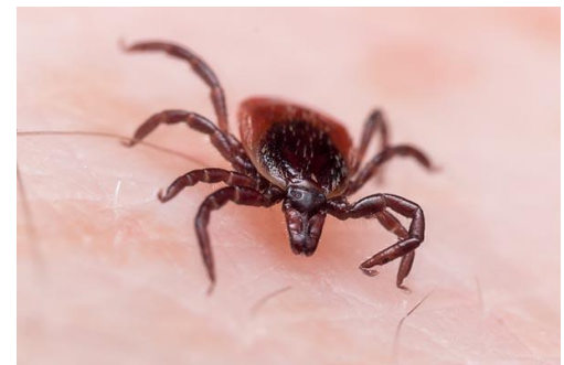
Adult female deer tick

Read more about Lyme Disease and prevention